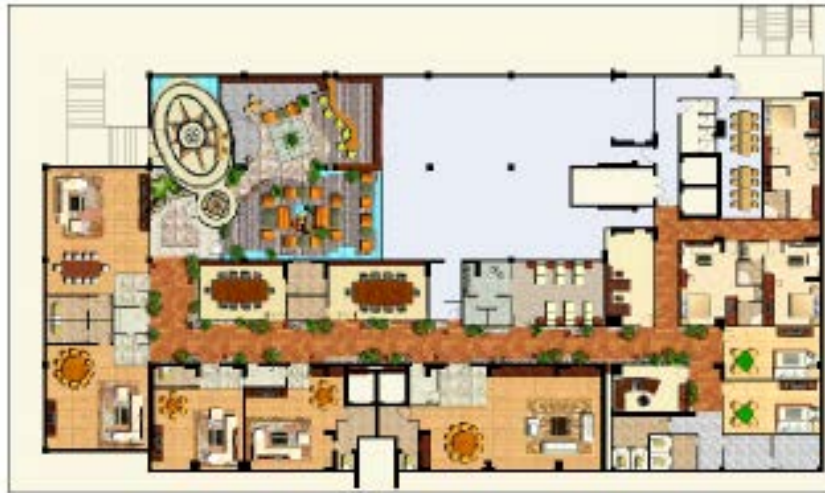
Fig.2 Illustration Art Performances.

adjust the linear way, change the line colour of Transparency (Transparency) it's easier to do similar visual effect, for example, when we want to give the floor of the indoor air q in drawings, make appropriate reflection effect, you can through the Gradient of such software (Gradient) or Lighting erect (Lighting effects) to simulate this subtle contrast feeling easily. Or you can use the Texture in the Filters to visualize this. The most typical example is when we want to give a carpet to make indoor effect of wool cloth with soft nap, we can give on a Noise (Noise), by adjusting its editing system of parameters easily making plush drag effect. As shown in figure 2 below, it can be seen that the software of illustration class makes the artistic expression of engineering drawing in interior design more incisively and vividly.